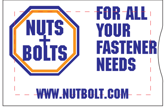
ARTWORK SHOWN is too close to the edge (safe area in red dotted outline)

Tight registration, large blocks of color, bleed/wrap. Can be corrected by simplifying logo, removing color block, changing text to solid color.